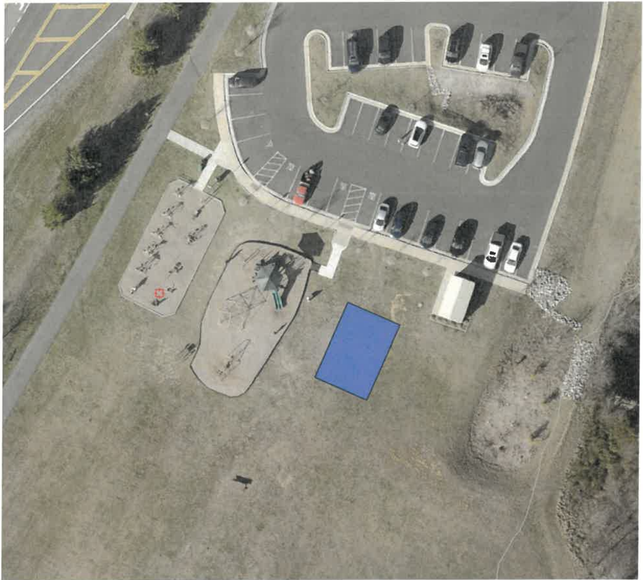
20' x 36' Similar to: Rose Hill, Brill, JW Colonels Capacity: 30-56-75