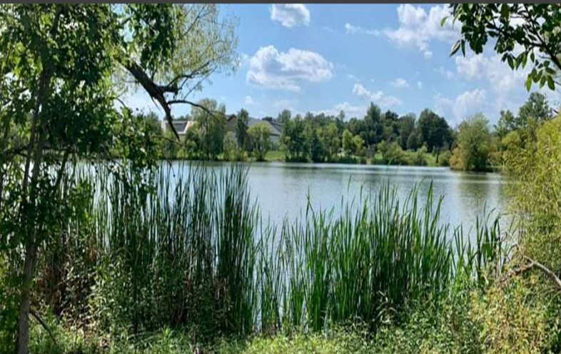
Bowman Library Trail