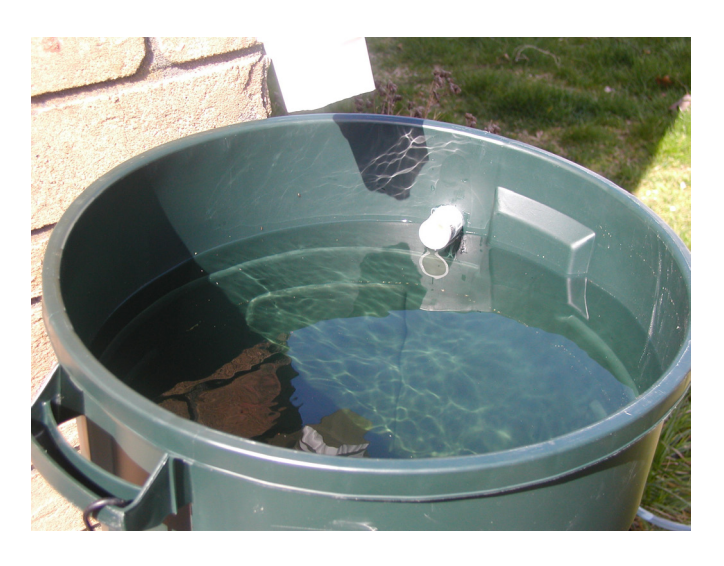
An example of a rain barrel filled with water. Rain barrels should always be covered with a lid and screen to prevent mosquito infestation.