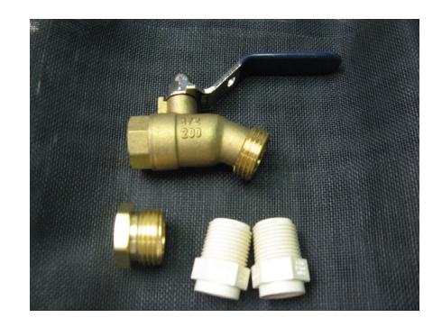
Figure 1. Rain barrel hardware (clockwise from top): a hose bib, two PVC male adapters, and a male garden hose adapter on a square of window screen.